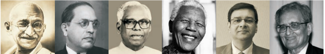
MK Gandhi Mahatma, Father of the Indian nation